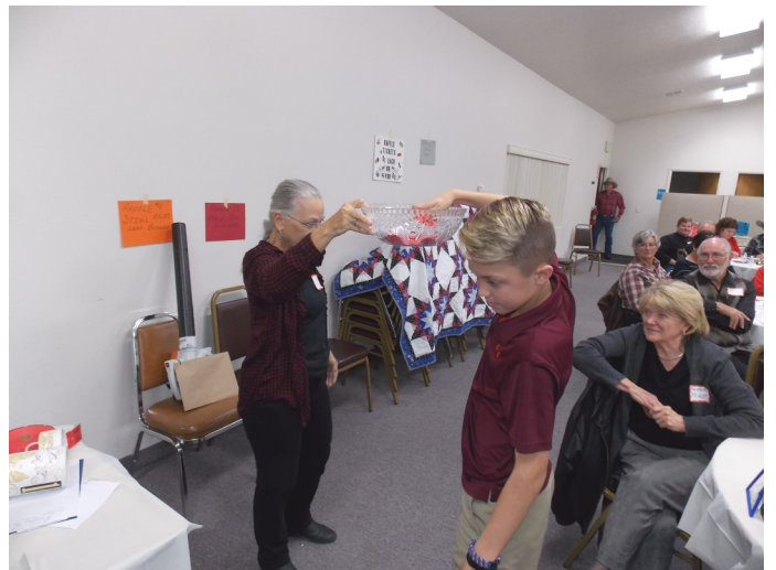
And the winning numbers are