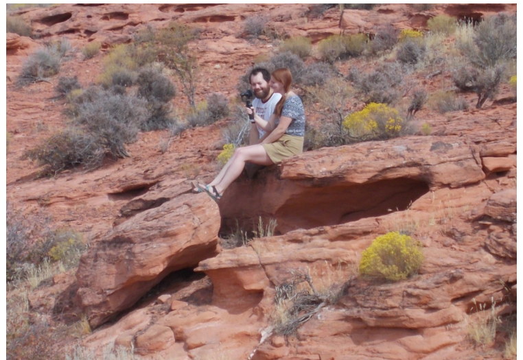
Filming the riders on the trail.