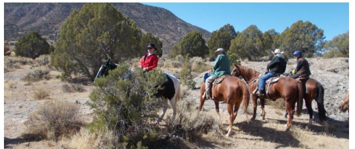
Gate Man of the Day!